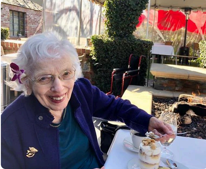
2/28/22 at Postino Restaurant in Lafayette CA